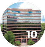
Marietta, GA Campus (470) 934-2650