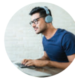
Competency Based Education (CBE) Online (865) 251-1800