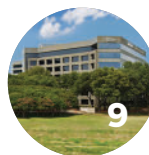
Dallas, TX Campus (469) 896-8275