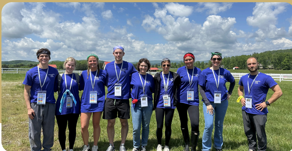
Pictured above: PA Graduate Students