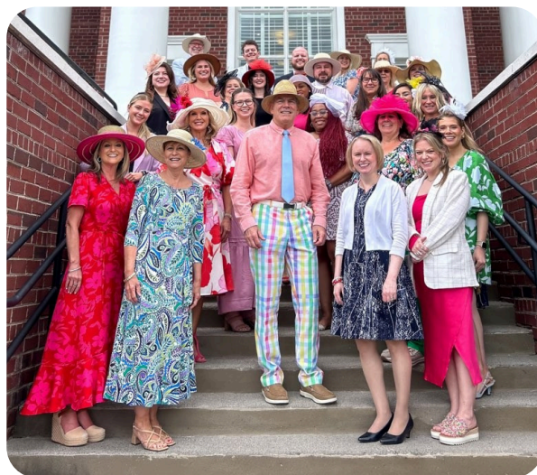
Pictured above: South College Knoxville's faculty, staff, and leadership team.